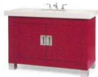
Cabinetry & Countertops PAGE 53