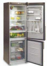
Appliances PAGE 76