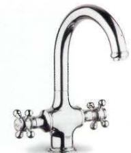
Faucets & Fixtures PAGE 101